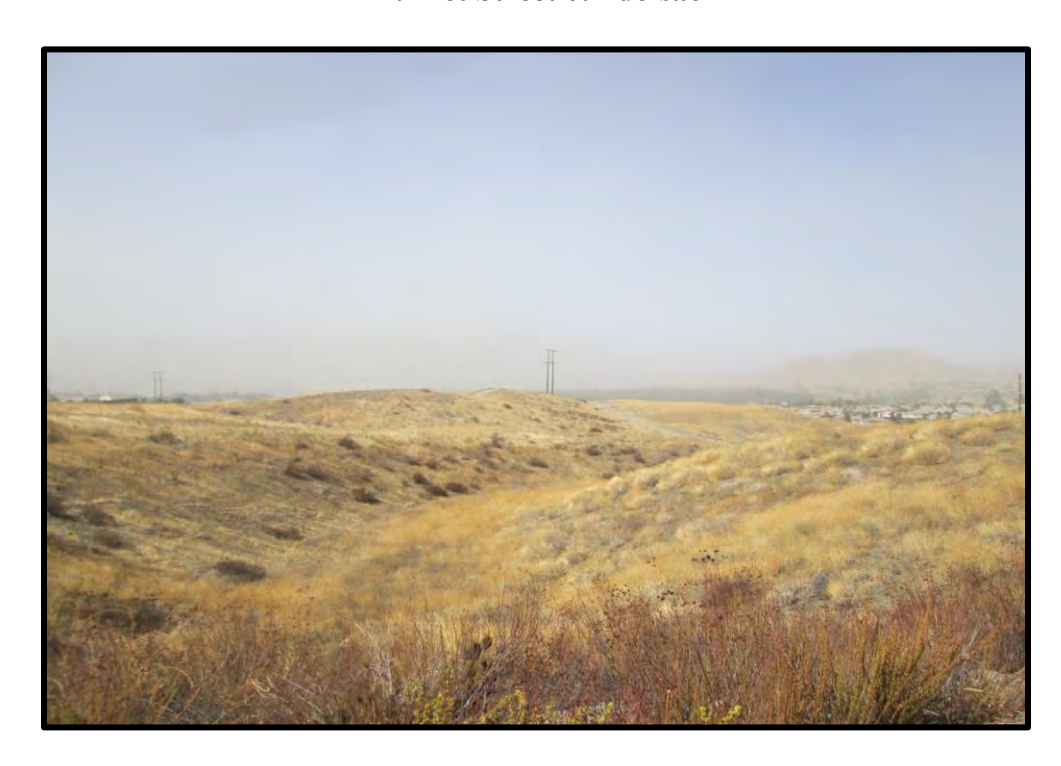
View of Subject Site to the West at the Burnet Street cul-de-sac, on East side