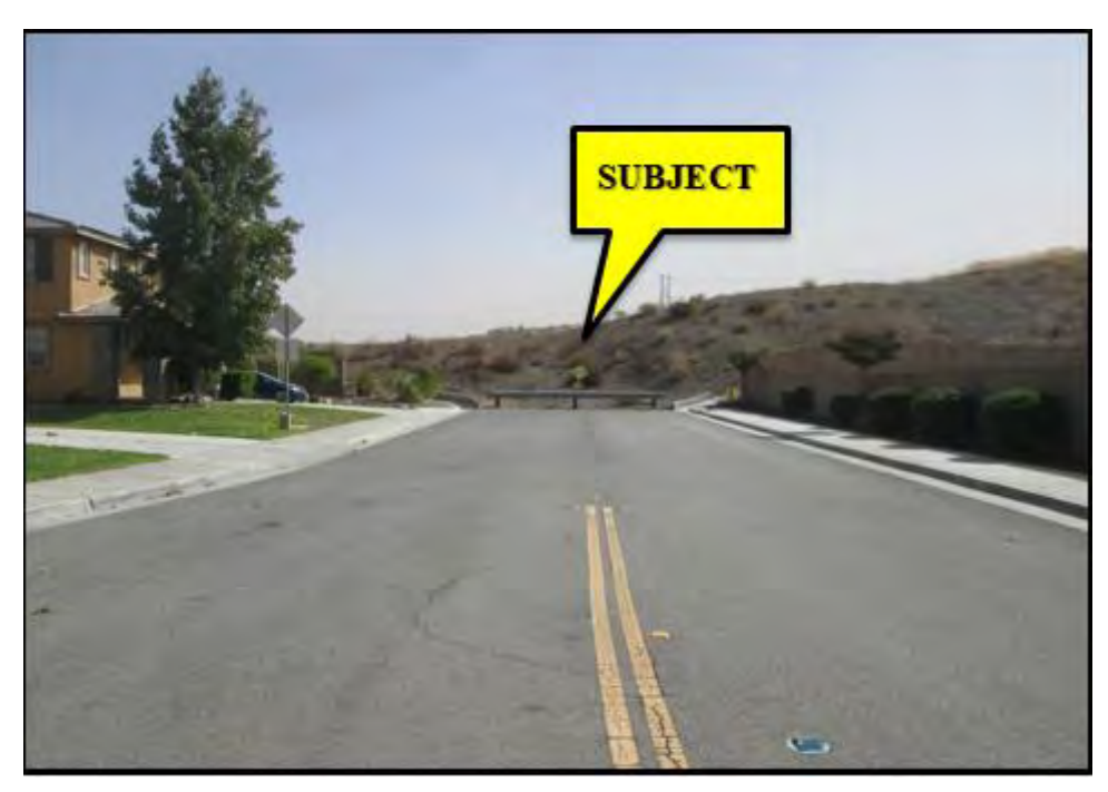
Chambord Road cul-de-sac