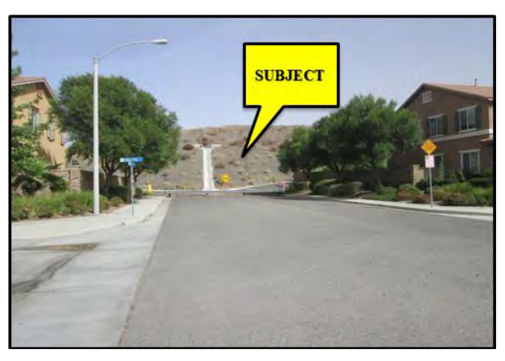
Elsinore Hills Road cul-de-sac