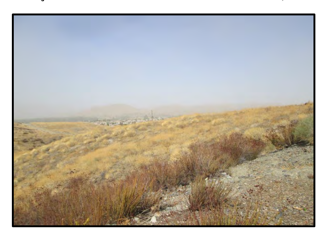
View of Subject Site to the Northwest at the Burnet Street cul-de-sac, on East side