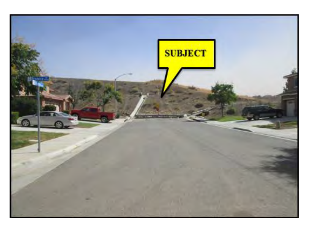
Starina Street cul-de-sac