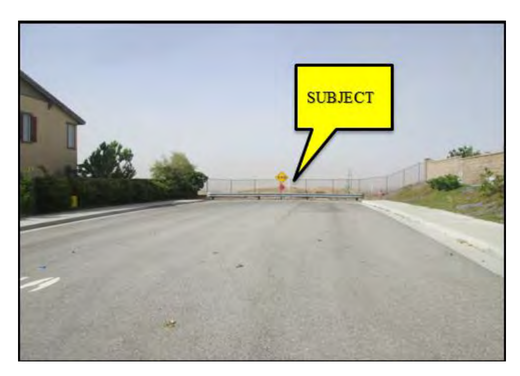
Burnet Street cul-de-sac