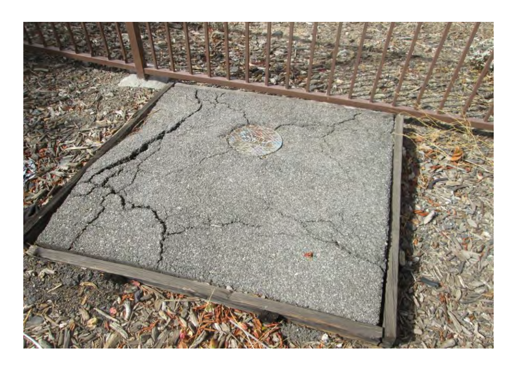
Water terminus at the Burnet Street cul-de-sac