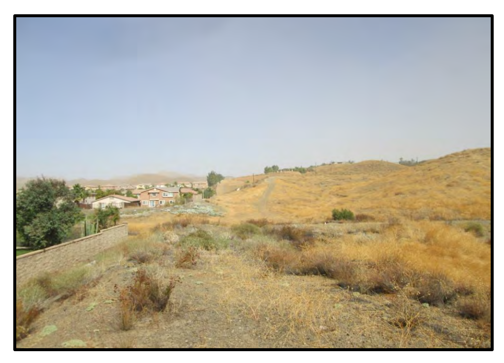
View of Subject Site to North at the Chambord Road cul-de-sac, on West side