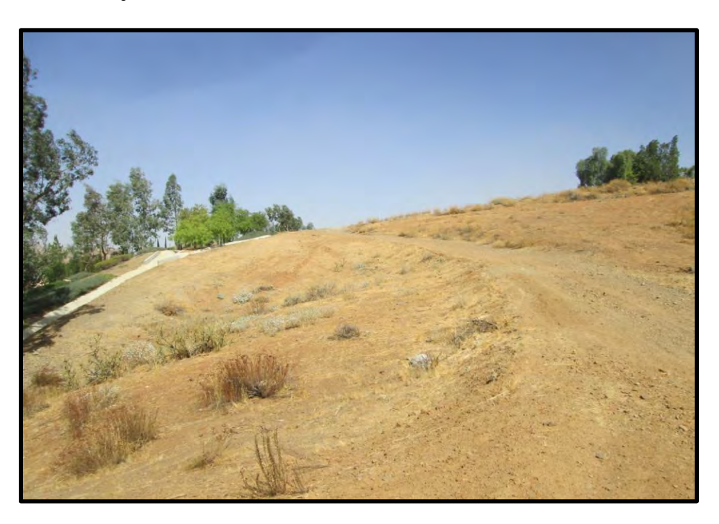
View of Subject site to North at the Starina Street cul-de-sac, on West side