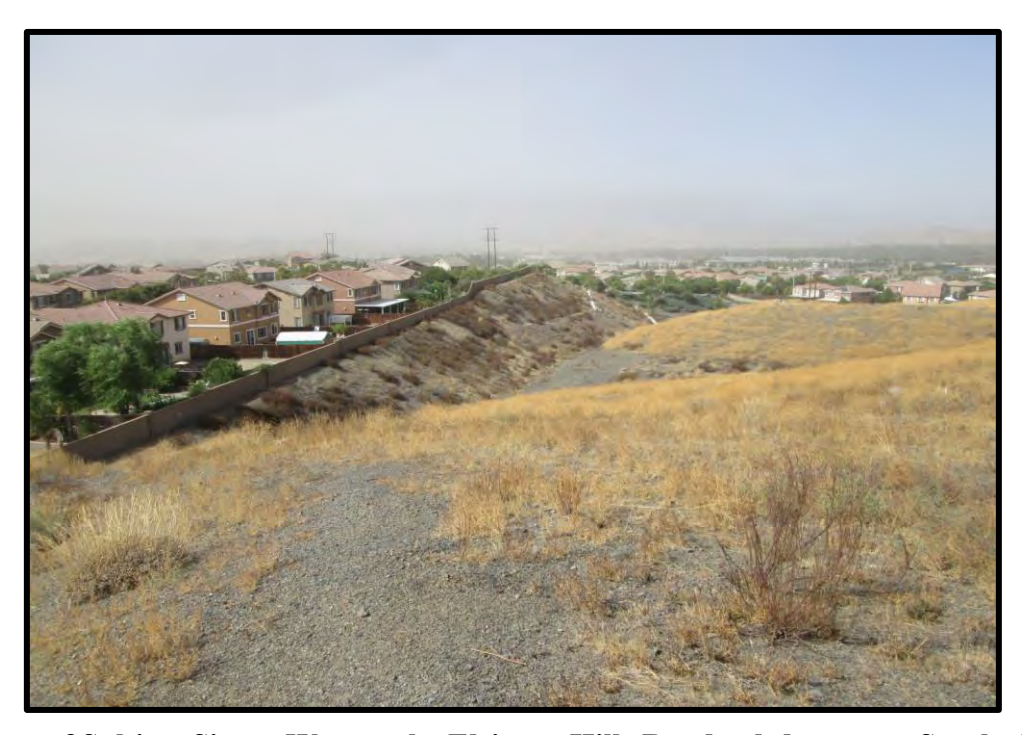
View of Subject Site to West at the Elsinore Hills Road cul-de-sac, on South side