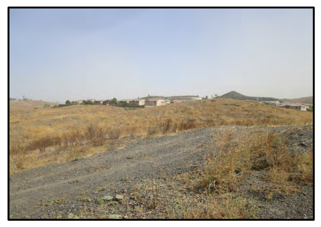
View of Subject Site to Northeast at the Elsinore Hills Road cul-de-sac, on South side