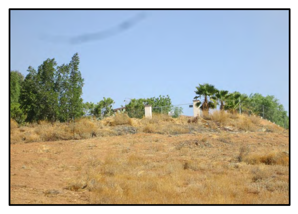
View of Subject site to North east at the Starina Street cul-de-sac, on West side