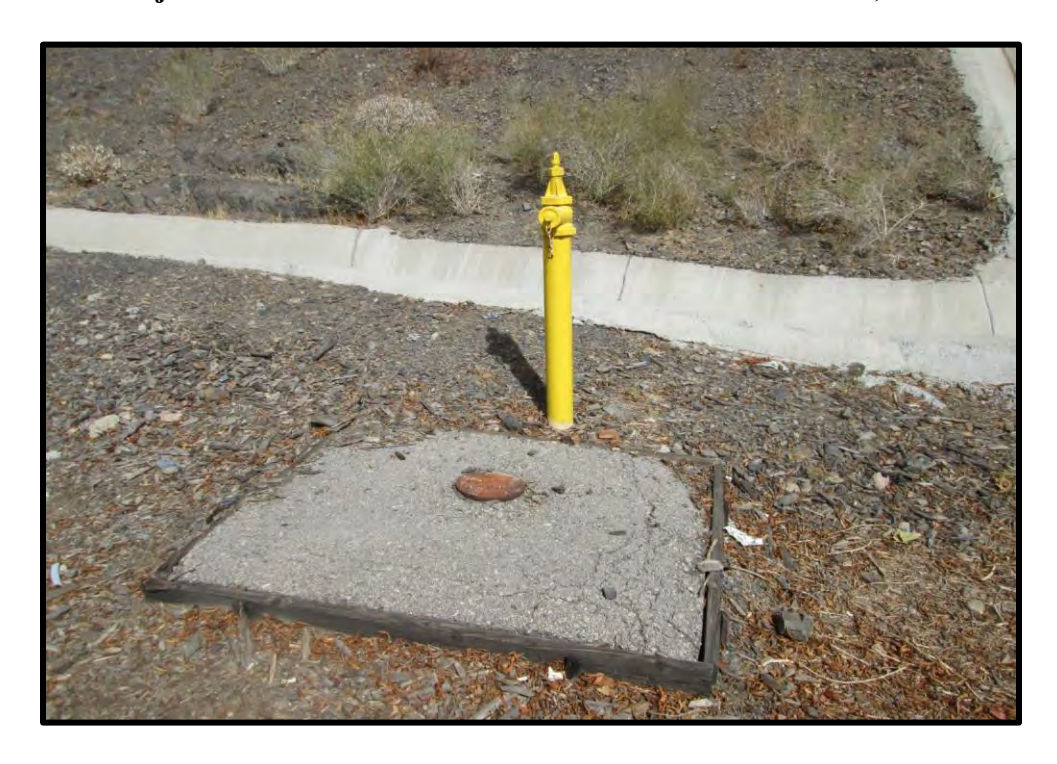
Water terminus at the Elsinore Hills Road cul-de-sac