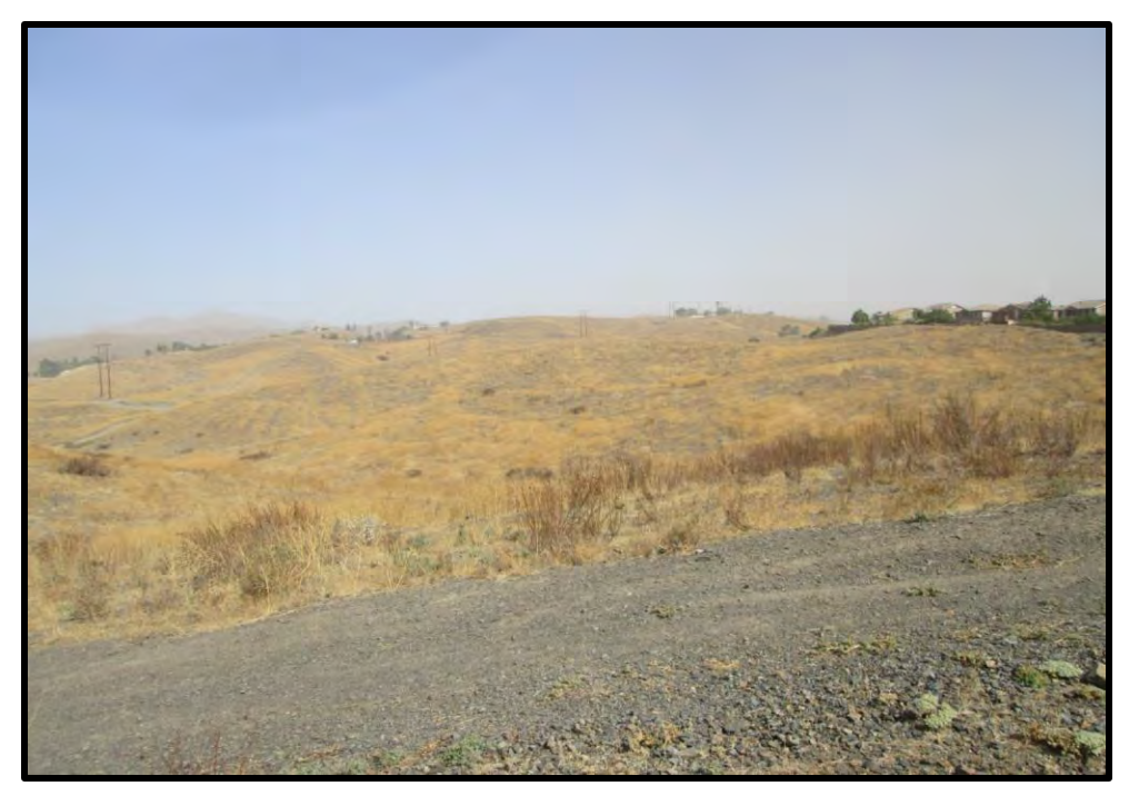
View of Subject Site to North at the Elsinore Hills Road cul-de-sac, on South side