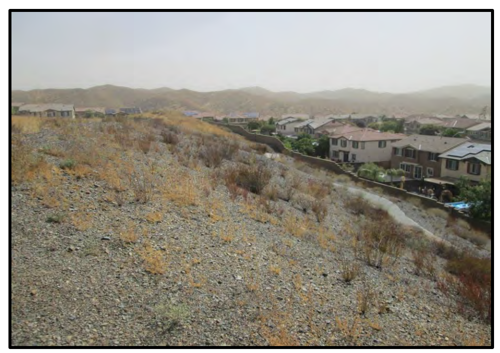
View of Subject Site to East at the Elsinore Hills Road cul-de-sac, on South side