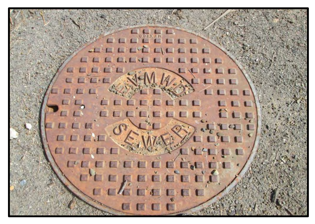
Sewer terminus at the Chambord Road cul-de-sac