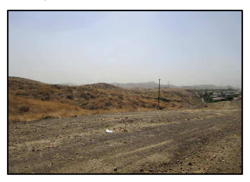
View of Subject to South east at the Starina Street cul-de-sac, on West side