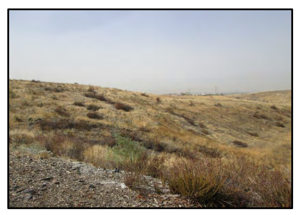
View of Subject Site to the Southwest at the Burnet Street cul-de-sac, on East side