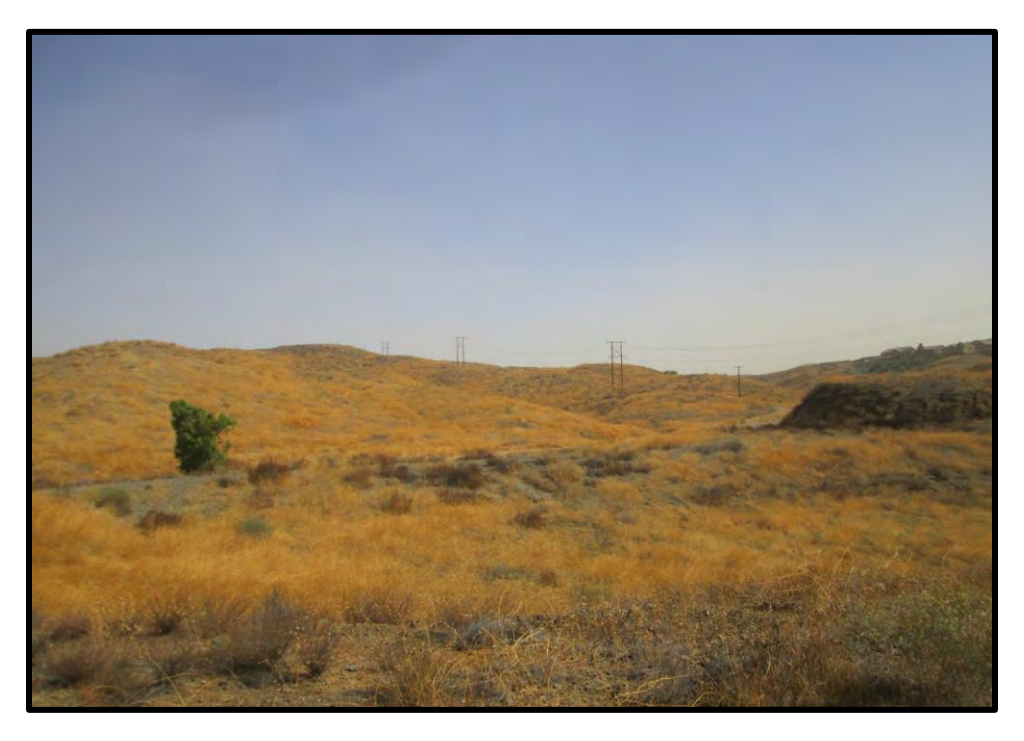
View of Subject Site to Northeast at the Chambord Road cul-de-sac, on West side