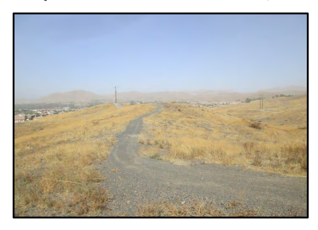
View of Subject Site to Northwest at the Elsinore Hills Road cul-de-sac, on South side