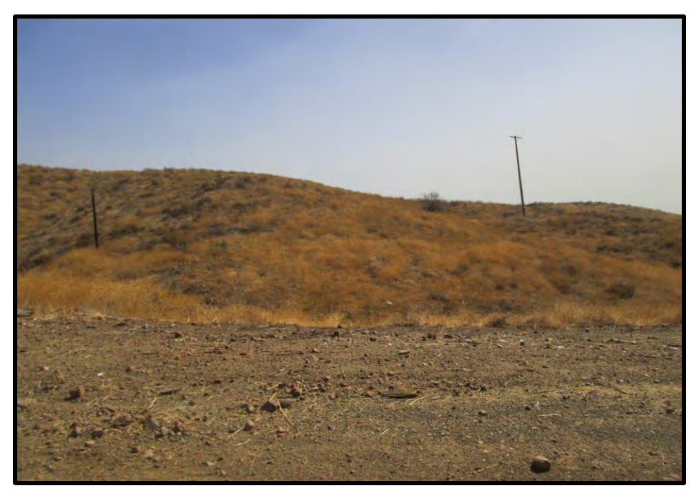
View of Subject Site to East at the Starina Street cul-de-sac, on West side