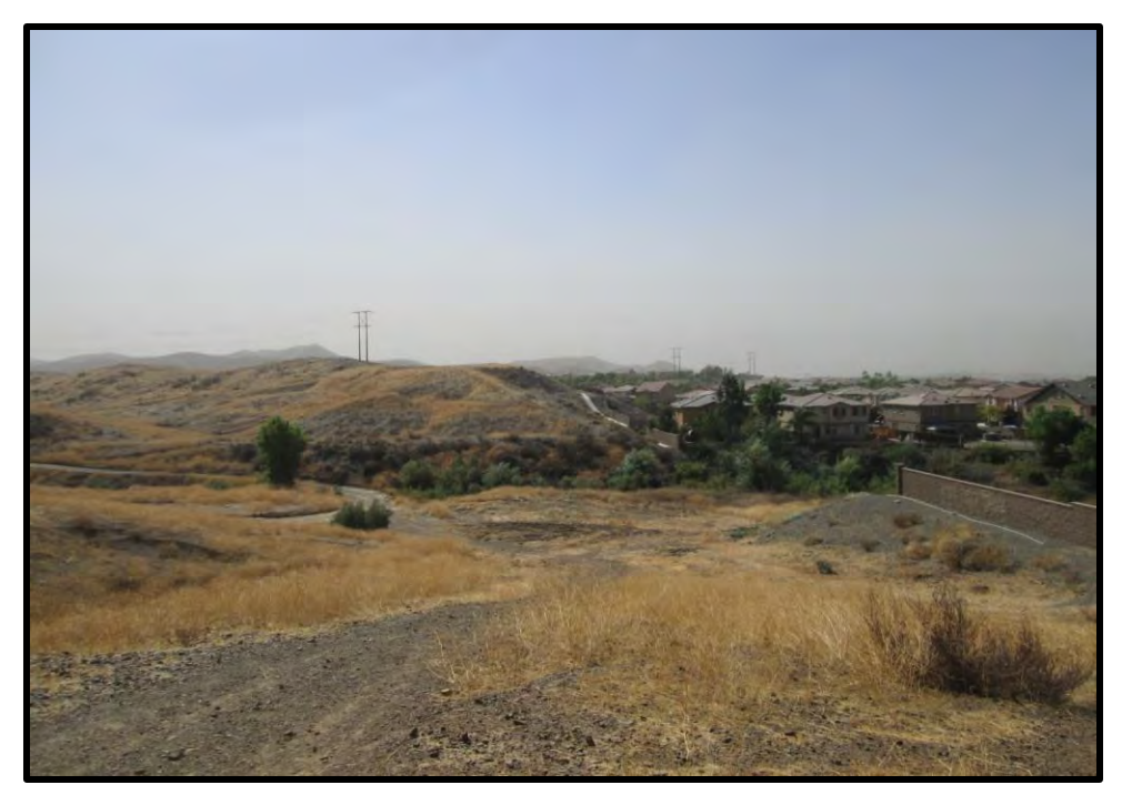
View of Subject Site to South at the Starina Street cul-de-sac, on West side